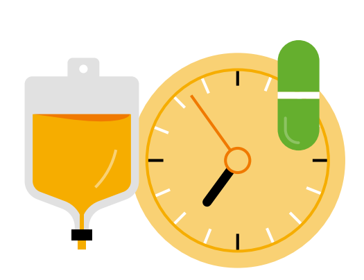
Avoid prolonged and unnecessary antimicrobial prophylaxis.

Prudent use of antimicrobials in healthcare settings is pivotal to combating antimicrobial resistance. The following actions can be taken in hospitals and long-term care facilities: